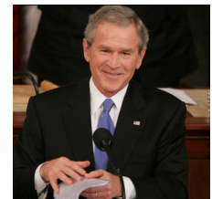
Out-going President George Bush

United States in November 2008. He will take the oath of office and become president on January 20, 2009. The theme for Mr. Obama's inauguration is "A New Birth of Freedom." Those words were said by President Abraham Lincoln during the civil war in the U.S one hundred years ago. President Lincoln hoped that the war, as terrible as it was, would bring good. Most Americans believe that the war did bring good. It ended slavery and kept the country together as one nation.