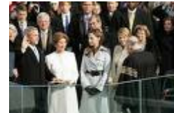
Bush sworn in as president in 2005.

When is an oath used in your native culture? Do people swear or affirm an oath? What kinds of promises do people make to each other?