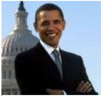
President-elect Barack Obama

Story: Inauguration means a formal ceremony to mark the beginning of something, such as a president's term of office. Mr. Barack Obama won the vote for president of the